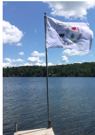
Blowing in the Wind