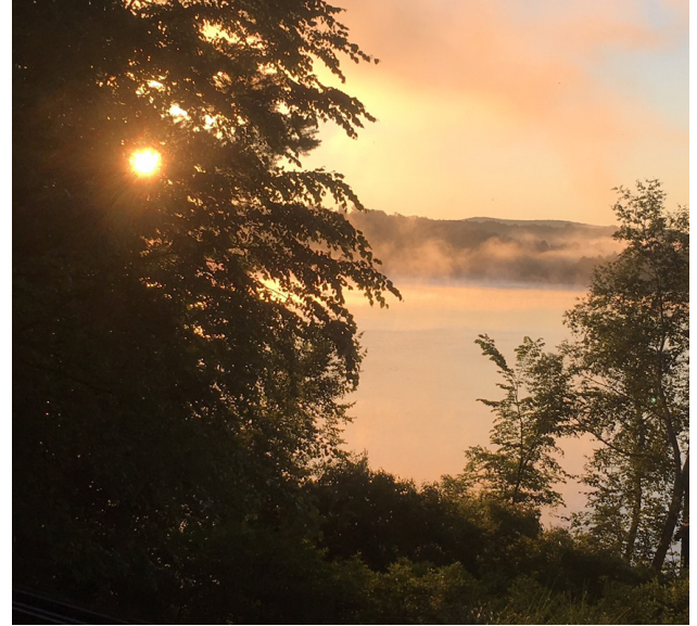
Foggy Morning Sunrise

Achievements in 2022 included new and updated signage on several of our trails, new memorial benches at Laurel Hill Park, significant trail maintenance on the Lower Bowker's Woods trail, and restoration of the marble Butler Bench atop Laurel Hill. LHA continued its tradition of sponsoring flowers at the post office in downtown Stockbridge. ( More information on LHA's properties is online at https://laurelhillassociation.org/trails-and-properties/ . )