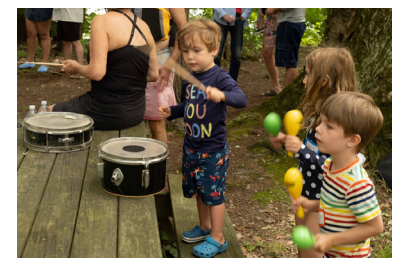
Auditioning for the BSO at the SBA Picnic