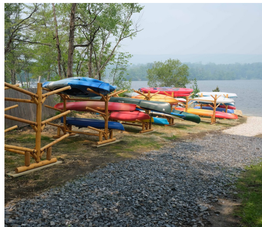
SBA-Funded Kayak Racks at Town Beach