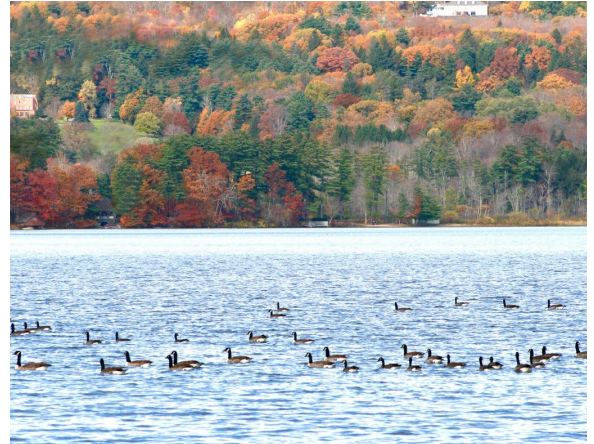
Second homeowners arrive for the season

By the way, the geese are second homeowners. I don't want to add to local divisiveness, but, hey, they fly away in the winter. Real second homeowners pay taxes. Does anyone know if putting in an Astroturf lawn is a violation of Stockbridge zoning laws?