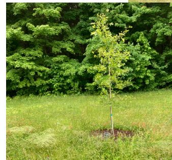
Oak trees honoring the pandemic first responders, medical personnel, support staff, and essential workers, as well as the Land Stewards of Stockbridge’s environmentally caring community.