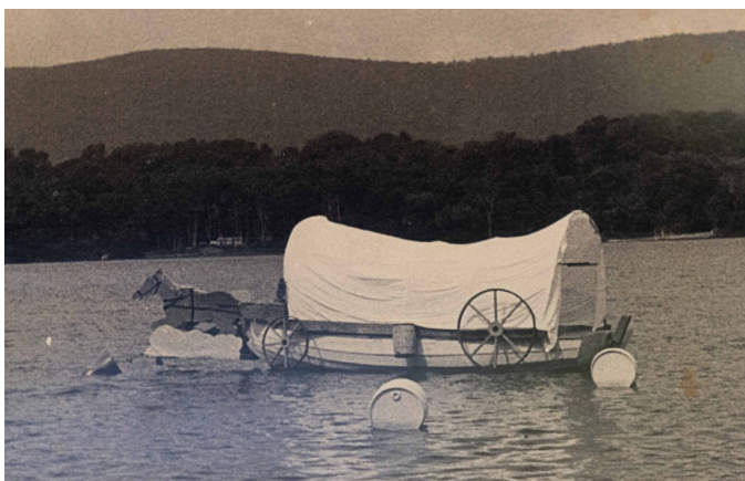
Creative way to beat the Tanglewood traffic

For the complete list of SBA Board Members, see back cover of newsletter.