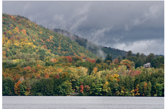
Autumn Colors by the Bowl