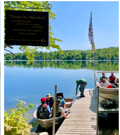
Bound for Home