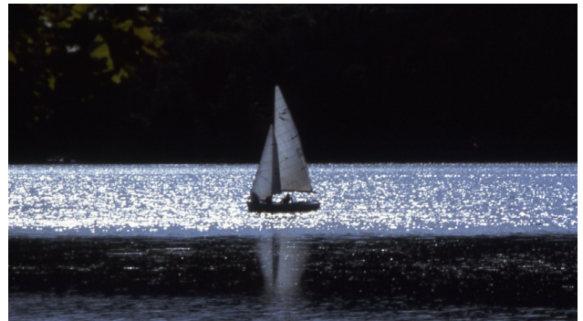
"A sailor is an artist whose medium is the wind..." ~ Webb Chiles