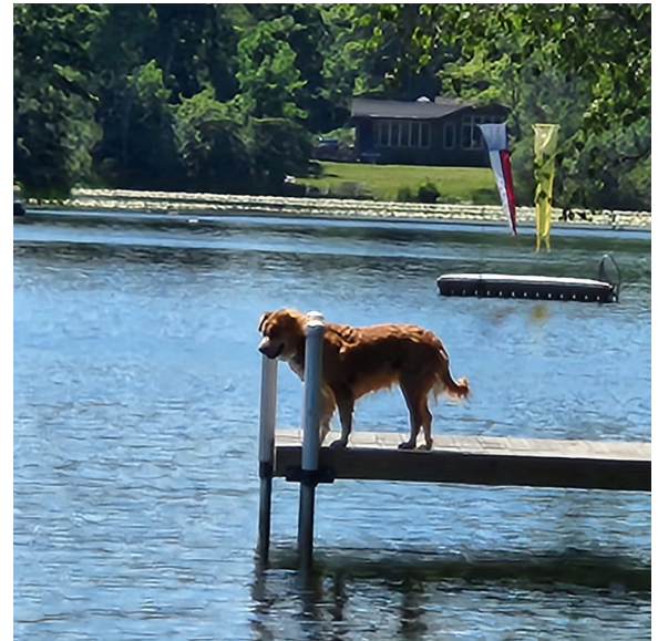
Do you hunt geese?